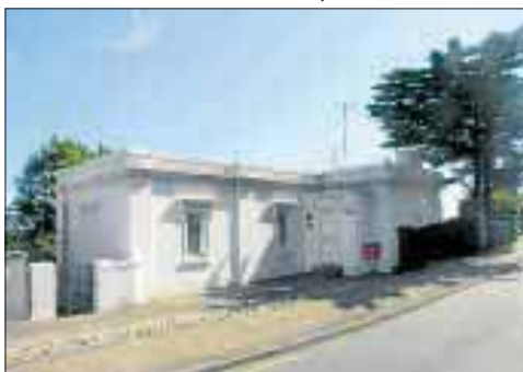
SHOREHAM-BY-SEA, WEST SUSSEX Two-bedroom house, £550,000

You might as well be living in a boat if you buy The Toll House. It sits right on the edge of the River Adur, which fills and drains with the tide, and it comes with a mooring, slipway and gate to an old smugglers' cave. It has two bedrooms, decking on which to sit and watch the sun set, an under-house store, studio and parking for four cars. Wake to the sound of the gulls each morning. A Wycherley (01273 473329).