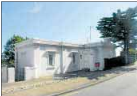
SHOREHAM-BY-SEA, WEST SUSSEX Two-bedroom house, £550,000

You might as well be living in a boat if you buy The Toll House. It sits right on the edge of the River Adur, which fills and drains with the tide, and it comes with a mooring, slipway and gate to an old smugglers' cave. It has two bedrooms, decking on which to sit and watch the sun set, an under-house store, studio and parking for four cars. Wake to the sound of the gulls each morning. A Wycherley (01273 473329).