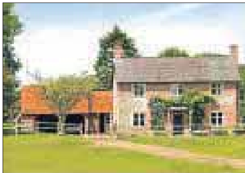
ENFORD, WILTSHIRE Four-bedroom cottage, £775,000

Make the dash from Paddington to Pewsey in 65 minutes and place yourself in an Area of Outstanding Natural Beauty between the Marlborough Downs and Salisbury Plain. Manor Cottage, seven miles from the station, was built in 1799 of brick and stone chequerboard. It is reached by a long private drive and has a studio, a big garden with fruit trees, and permission to extend. Knight Frank (01488 682726).