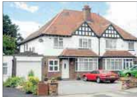
MOSELEY, BIRMINGHAM Four-bedroom semi, £395,000

Family friendly within a top school area